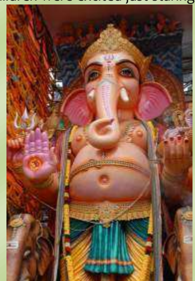
Figure 41: The famous Kharatabad Genaesh

Sirisha: I felt very happy going with all and enjoyed a lot.