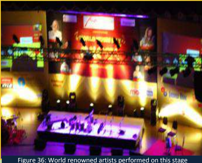
Figure 36: World renowned artists performed on this stage