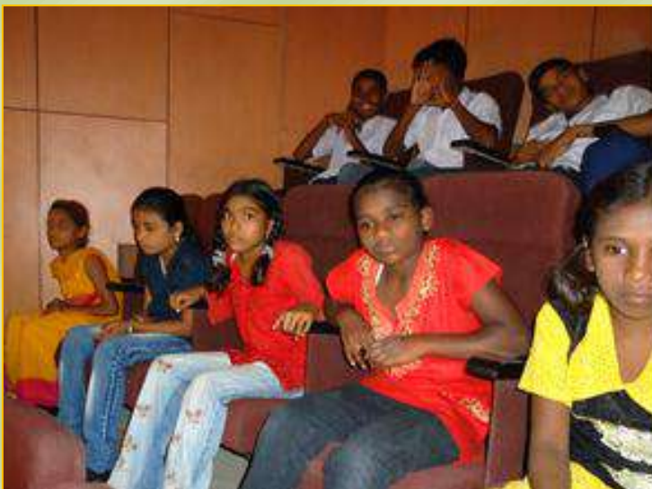
Figure 38: Children at the auditorium listening to the music

It was one of the most cherished memories for the children as well as the team to watch world renowned musicians performing live for them. They were spell bound throughout the program and enjoyed the beauty of Music in that beautiful place of the city.