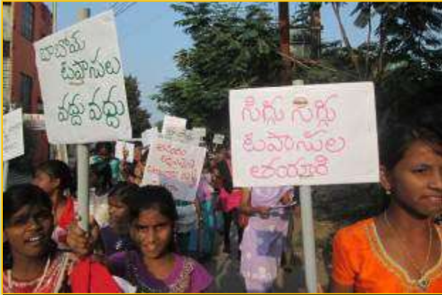
Figure 18: Bhargavi, Laxmi, Nagamani during Rally