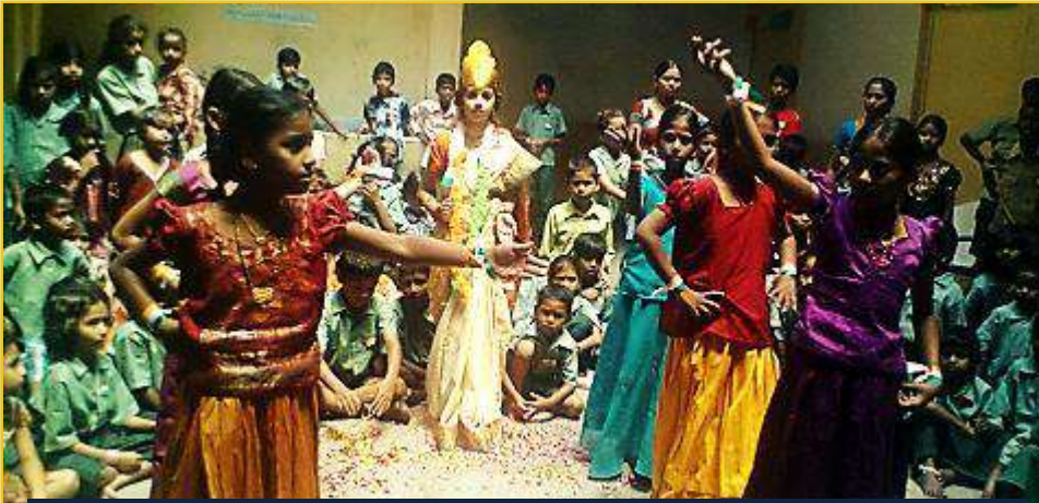
Figure 22: Children are performing the dance programme in the school for the song 'Desam Manade'