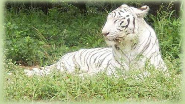
Figure 40: Rare animal, the white tiger, at zoo park

Then they went to the birds section where they found different kinds and colourful birds which are really nice. Different kinds of peacocks, one is in white colour and another one is little short and with black and green color shades. It was really wonderful with colours and its dance attracting everyone. The children wanted to collect its feathers. From there they move on to the other place and saw a white tiger, a special attraction in this zoo. It was amazing to see when it roars loudly from far a distance. The big Elephant was riding little children on it.