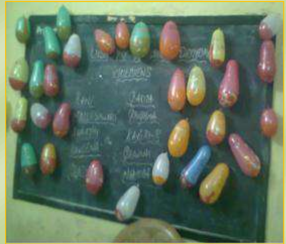
Figure 30: The Children decorated the Board with colourful balloons.